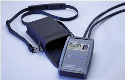
Shoulder bag EMA 200 Order no. 9074.0001