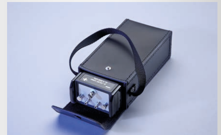
Carrying bag EMA 84 Order no. 9063.0001 (without LCD viewing window) Order no. 9064.0001 (with LCD viewing window)